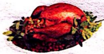
Turkey Dinner November 12, 2017